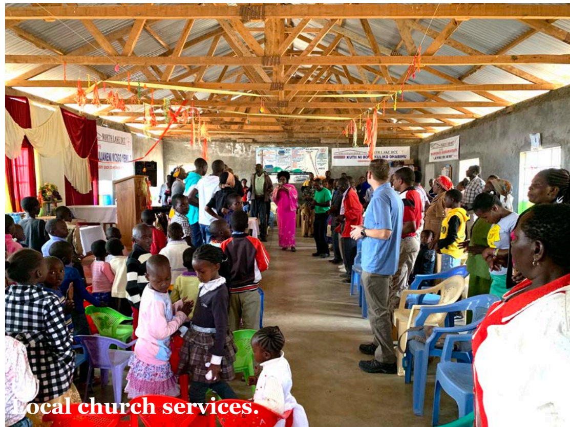
Local church services.