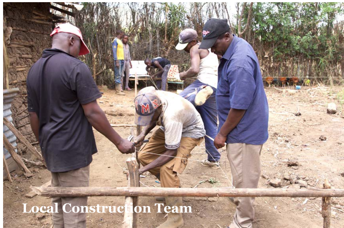
Local Construction Team