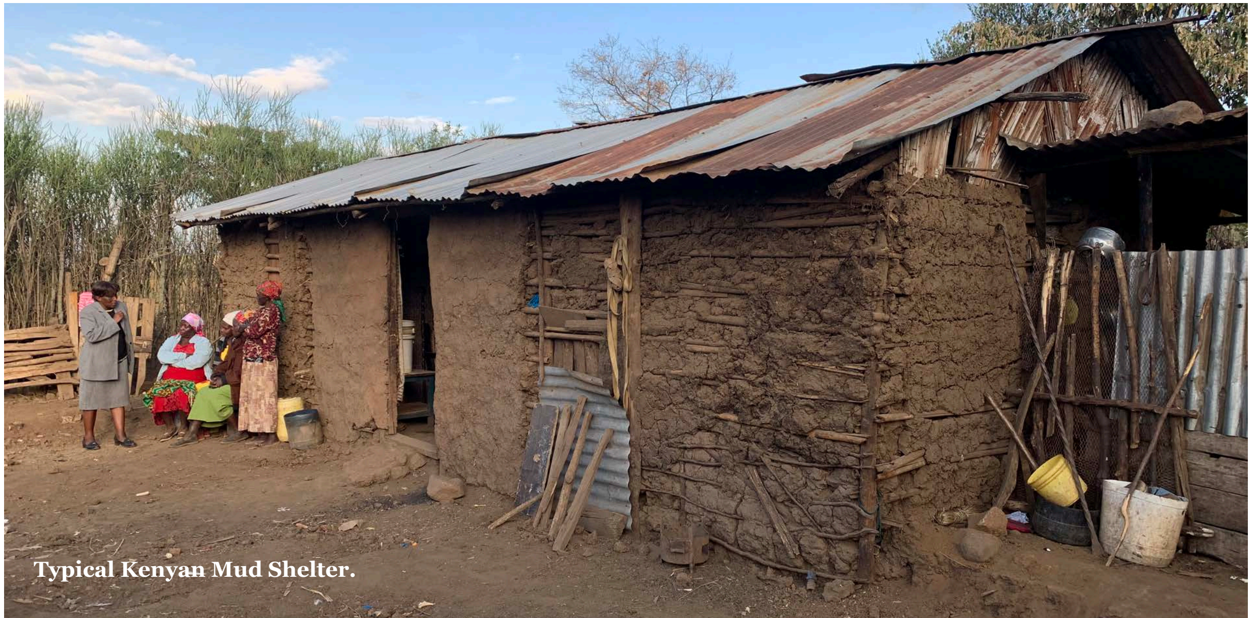
Typical Kenyan Mud Shelter.