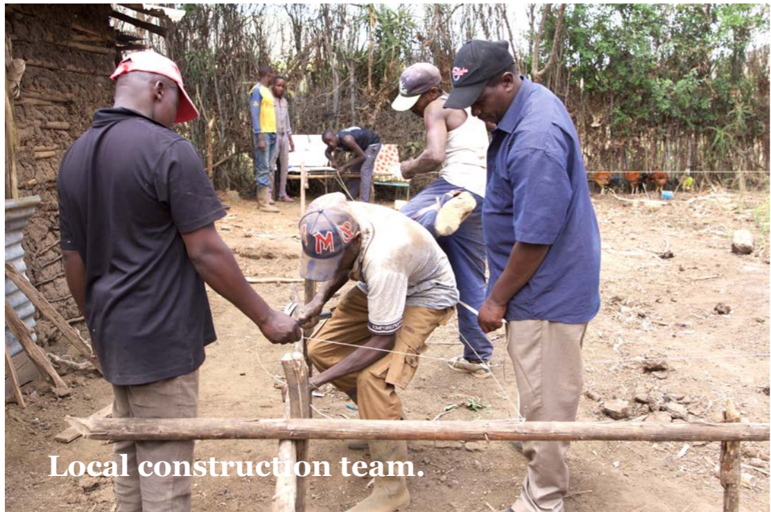
Local construction team.